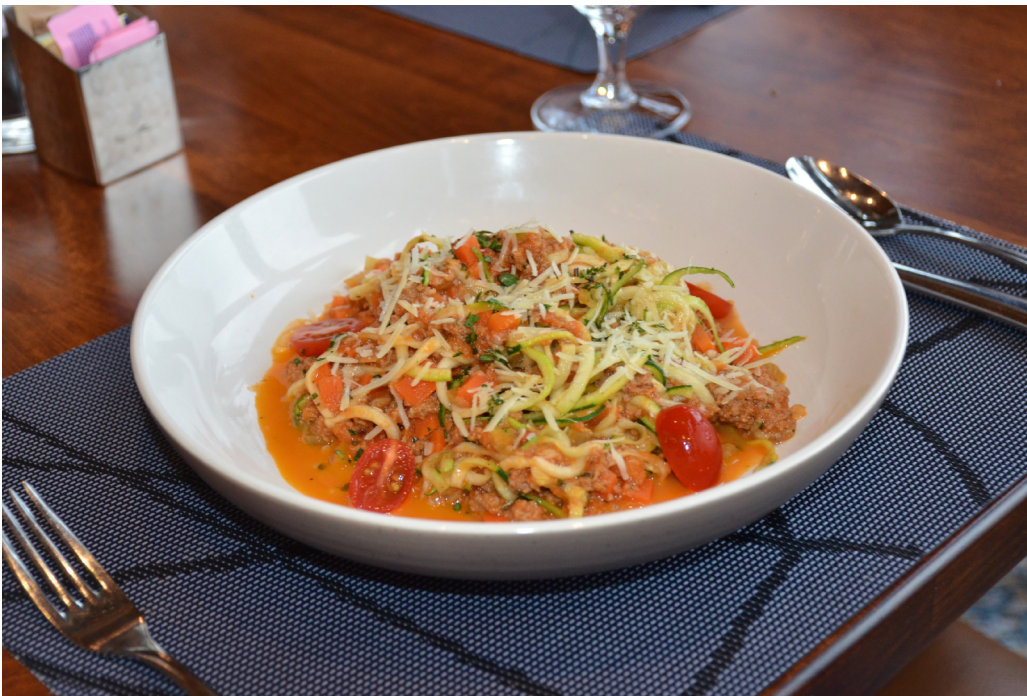
TURKEY BOLOGNESE WITH ZUCCHINI "NOODLES" | 17 TF | GF

Local Greens, Toasted Almonds, Red Onions, Wildflower Honey-Yogurt Dressing