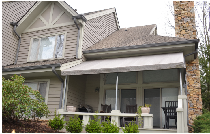
1013 Indian Cave | $ 329,000 | 1,811 SQFT