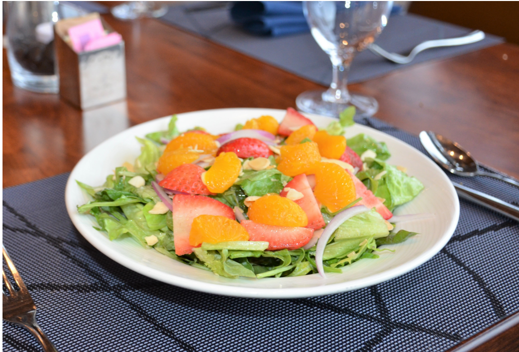
STRAWBERRY & ORANGE SALAD | 8 TF | GF

Less than 500 calories & 5 grams of saturated fat per plate.