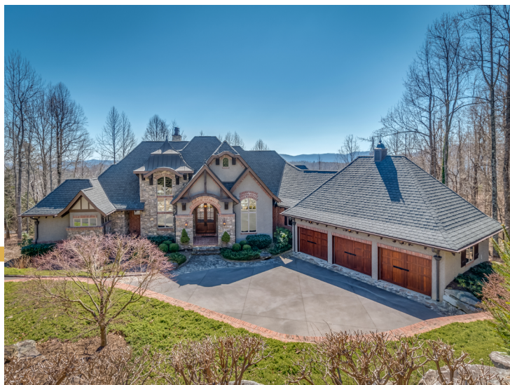
307 Piney Knoll | $2,250,000 | 5,342 SQFT