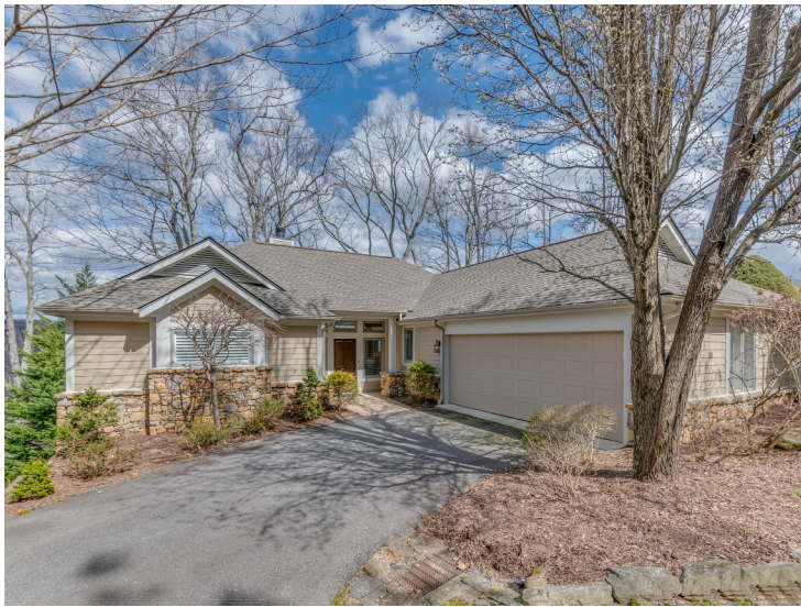
8 Spring Ridge | $630,000 | 2,653 SQFT